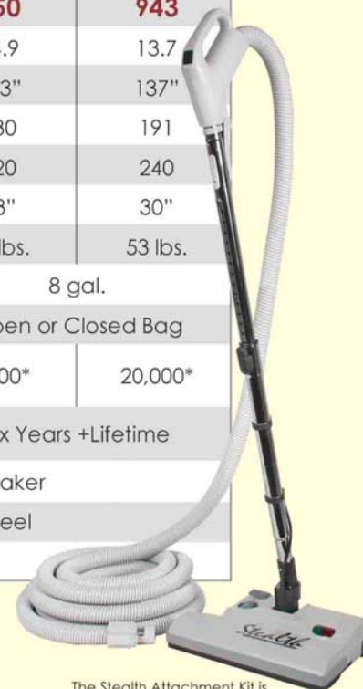
The Stealth Attachment Kit is an excellent compliment to all Flo-Master Central Vacuums.

MD CENTRAL VACUUMS for all seasons your central vacuum